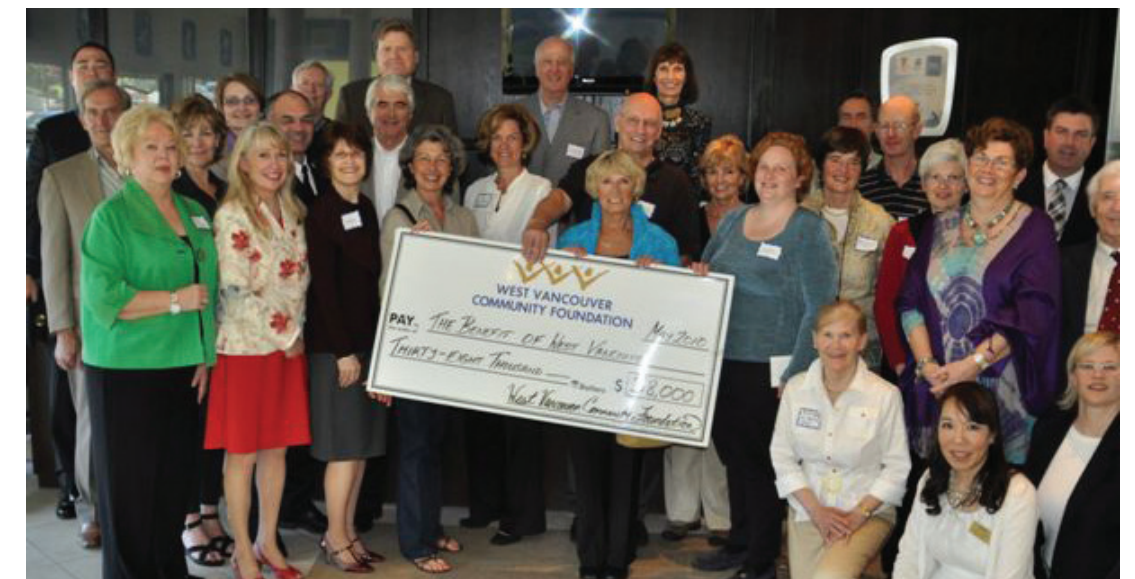
Grant recipients and friends.

Our new address is: Fulton House, Lower Level, 1538 Fulton Avenue, West Vancouver. Parking is available on Fulton Avenue.